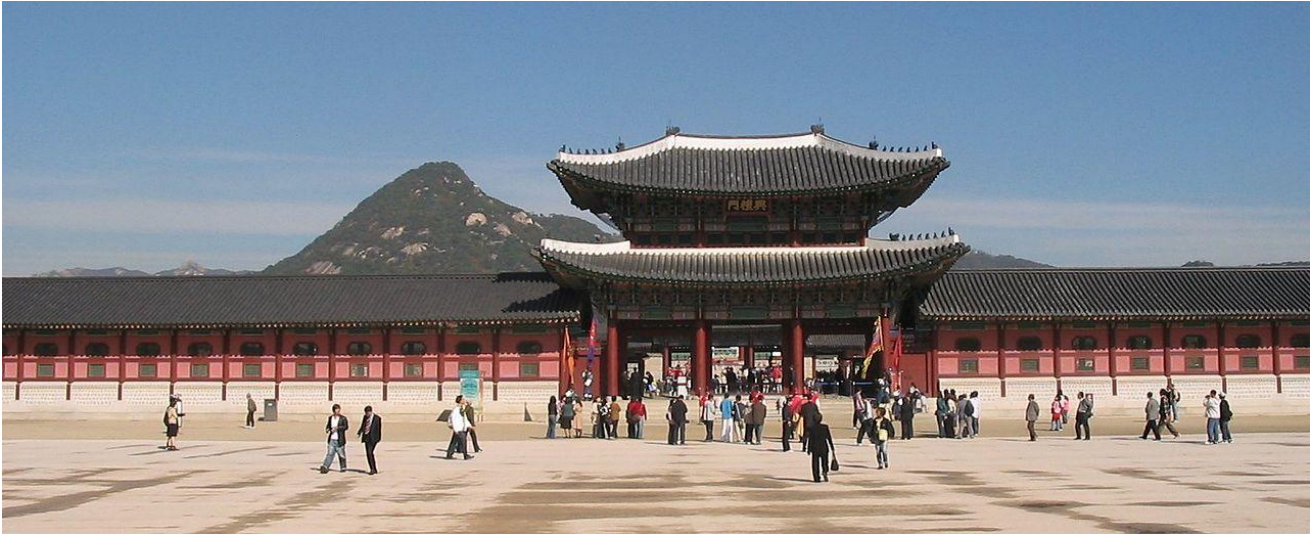
Seoul's Gyeongbokgung Palace

Pauwels Travel Bureau Ltd. 55 Dufferin Avenue, Brantford, Ontario N3T 4P6 Tel: 519-753-2695/1-800-380-3974 - Fax: 519-753-6376 tours@pauwelstravel.com – www.pauwelstravel.com