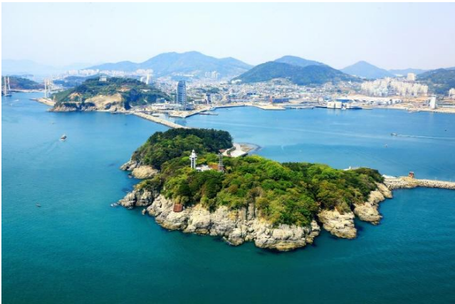
< Odongdo Island

Day 5 – Thursday, September 10: (B/L/D) After breakfast, drive to Suncheon for visits to Naganeupseong folk village and fortress, illustrating the traditional architecture and lifestyle of Korea’s southern provinces, and Suncheonman Bay Wetland Reserve. Late afternoon arrival in Yeosu, one of the country's most picturesque seaports, located at the southern tip of the Korean peninsula. Dinner and overnight in the 4-star Hidden Bay Hotel. Today, lunch will be included as well as dinner in the hotel, to be followed by a leisurely tour of Yeosu’s scenic Odongdo Island.