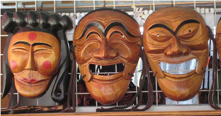
< Masks for sale at Andong Hahoe Folk Village

Day 11 – Wednesday, September 16: (B/L/D) On to the city of Andong for lunch, Andong Hahoe Folk Village, located in a bucolic setting on the banks of the Nakdong River and at the foot of Hwasan Mountain, and featuring picturesque houses belonging to families of the Ryu clan. In the afternoon we continue to Pyeongchang, home of the 2018 Winter Olympics, situated in the Taebaek Mountains region. Dinner and overnight in the Alpensia Holiday Inn.