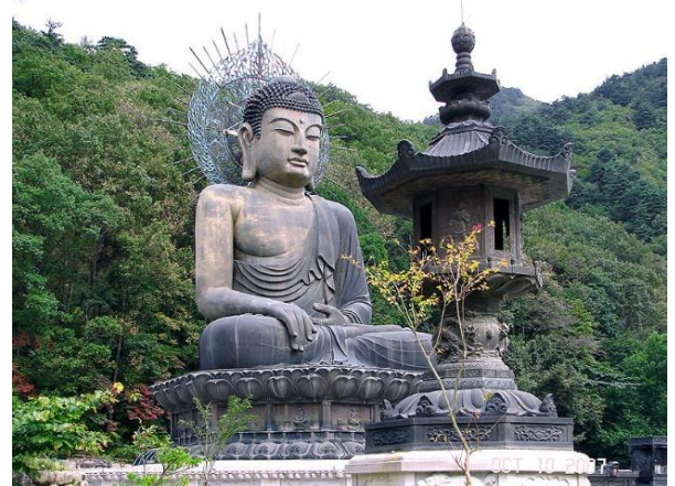
Bronze Buddha at Sinheungsa Temple >

Day 14 – Saturday, September 19: (B/L) Full-day excursion to Panmunjeom, site of the armistice that ended (or did it?) the Korean War, with the Armistice Commission Building and the Joint Security Area, and the Demilitarized Zone (DMZ), including sights such as Dorasan Observatory, where one can peek into North Korea, and Dorasan Station, the northernmost stop on South Korea's railway line. Lunch will be included. Return to Seoul and free evening.